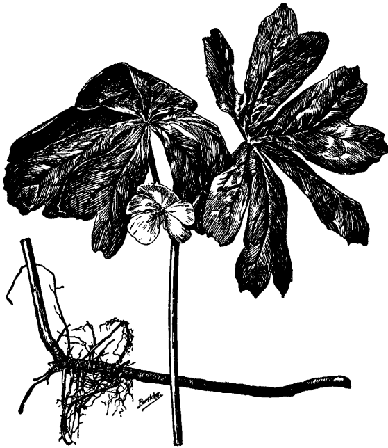
May-apple ( Podophyllum Peltatum ), Upper Portion of Plant with Flower and Rootstock.

DESCRIPTION OF PLANT —A patch of May-apple can be distinguished from afar, the smooth, dark-green foliage and close and even stand making it a conspicuous feature of the woodland vegetation.