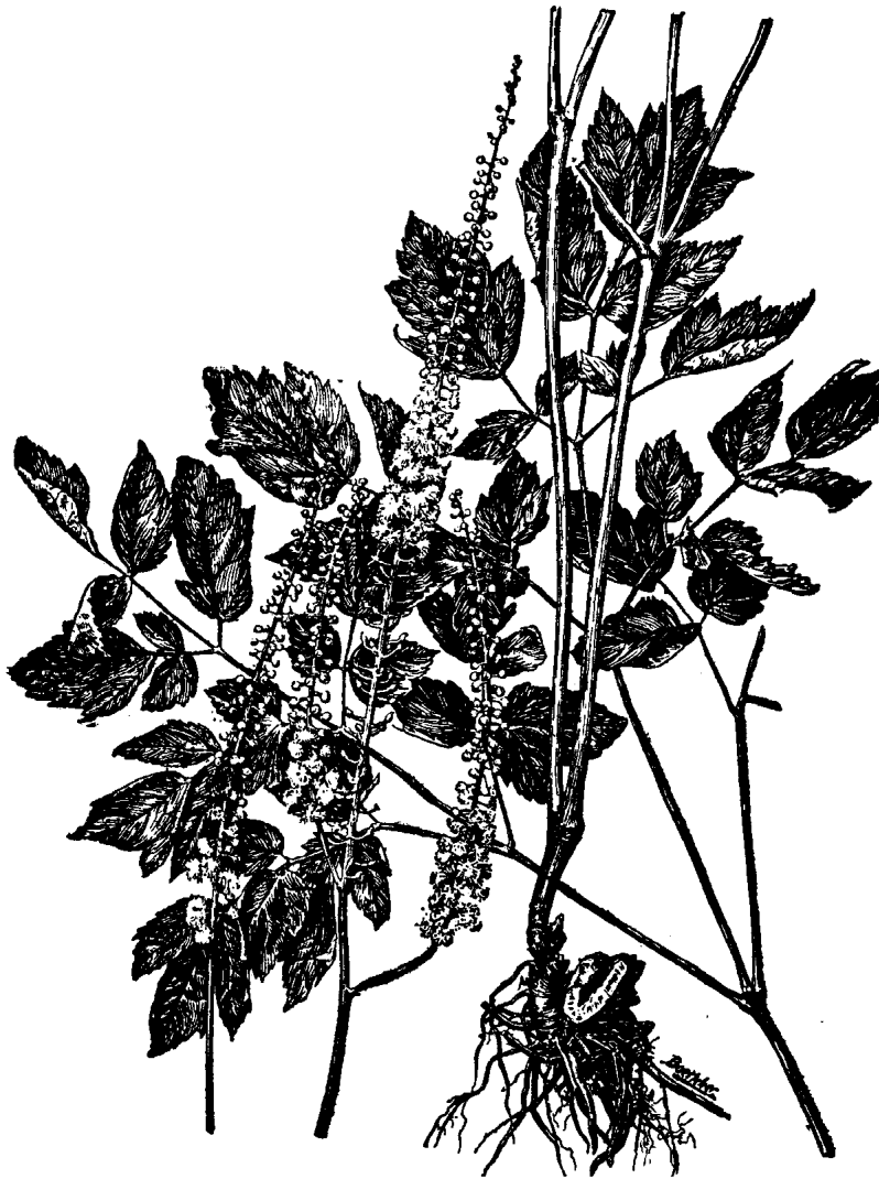
Black Cohosh ( Cimicifuga Racemosa ) Leaves, Flowering Spikes and Rootstock.

OTHER COMMON NAMES —Black snakeroot, bugbane, bugwort, rattlesnakeroot, rattleroot, rattleweed, rattletop, richweed, squawroot.