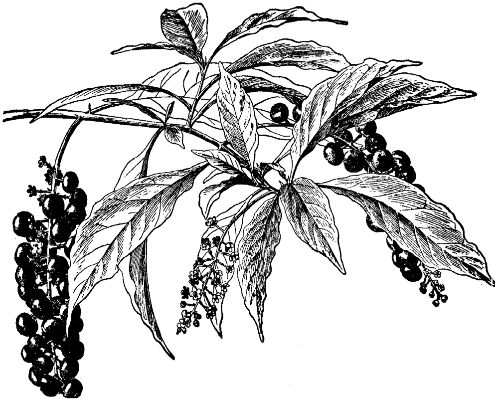
Pokeweed (Phytolacca Decandra), Flowering and Fruiting Branch.

HABITAT AND RANGE —Pokeweed, a common, familiar, native weed, is found in rich, moist soil along fence rows, fields, and uncultivated land from the New England States to Minnesota south to Florida and Texas.