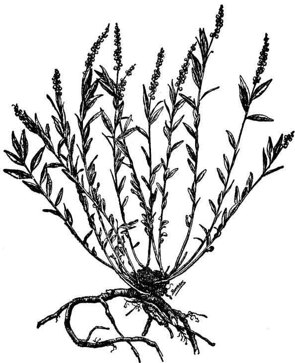
Seneca Snakeroot (Polygala Senega), Flowering Plant with Root.

HABITAT AND RANGE —Rocky woods and hillsides are the favorite haunts of this indigenous plant. It is found in such situations from New Brunswick and western New England to Minnesota and the Canadian Rocky Mountains, and South along the Allegheny Mountains to North Carolina and Missouri.